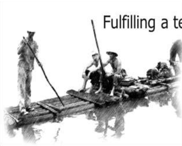
Fulfilling a teenage dream