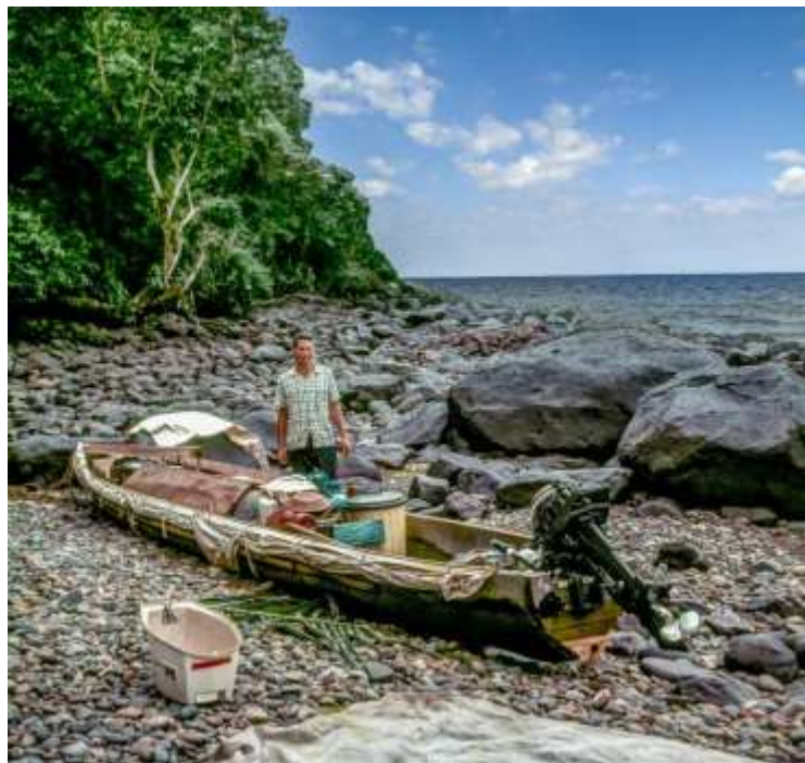
A 30-foot dugout canoe I traveled 170-miles down the coast of Panama towards Columbia to inspect Liki Tiki Too under construction.