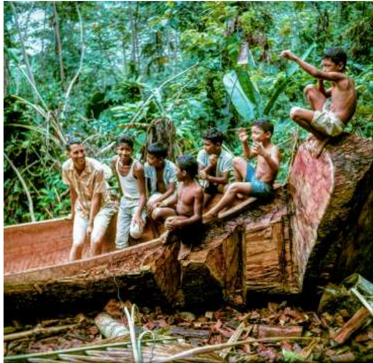
Liki Tiki Too under construction.